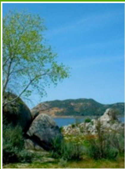
Idyllic views of Lake Morena