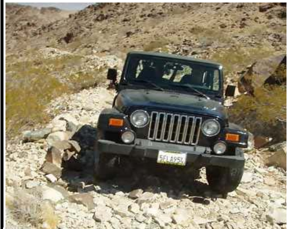
Brooklyn Mine Jeep Trail