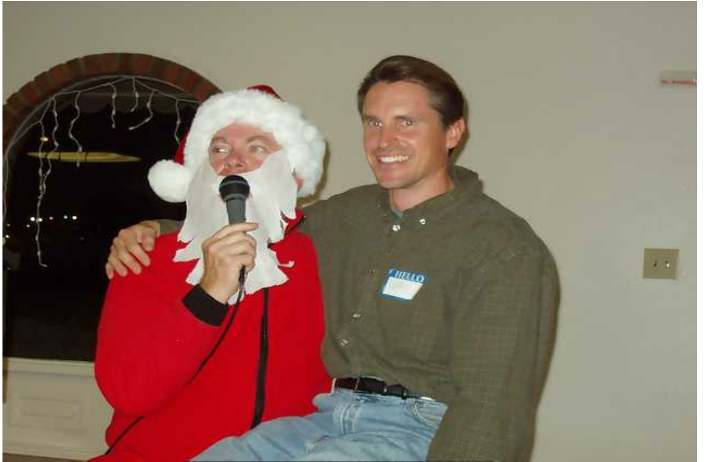
Holiday Party at Date Palm December 2003 Santa seems to have insight into every guy's wishes.