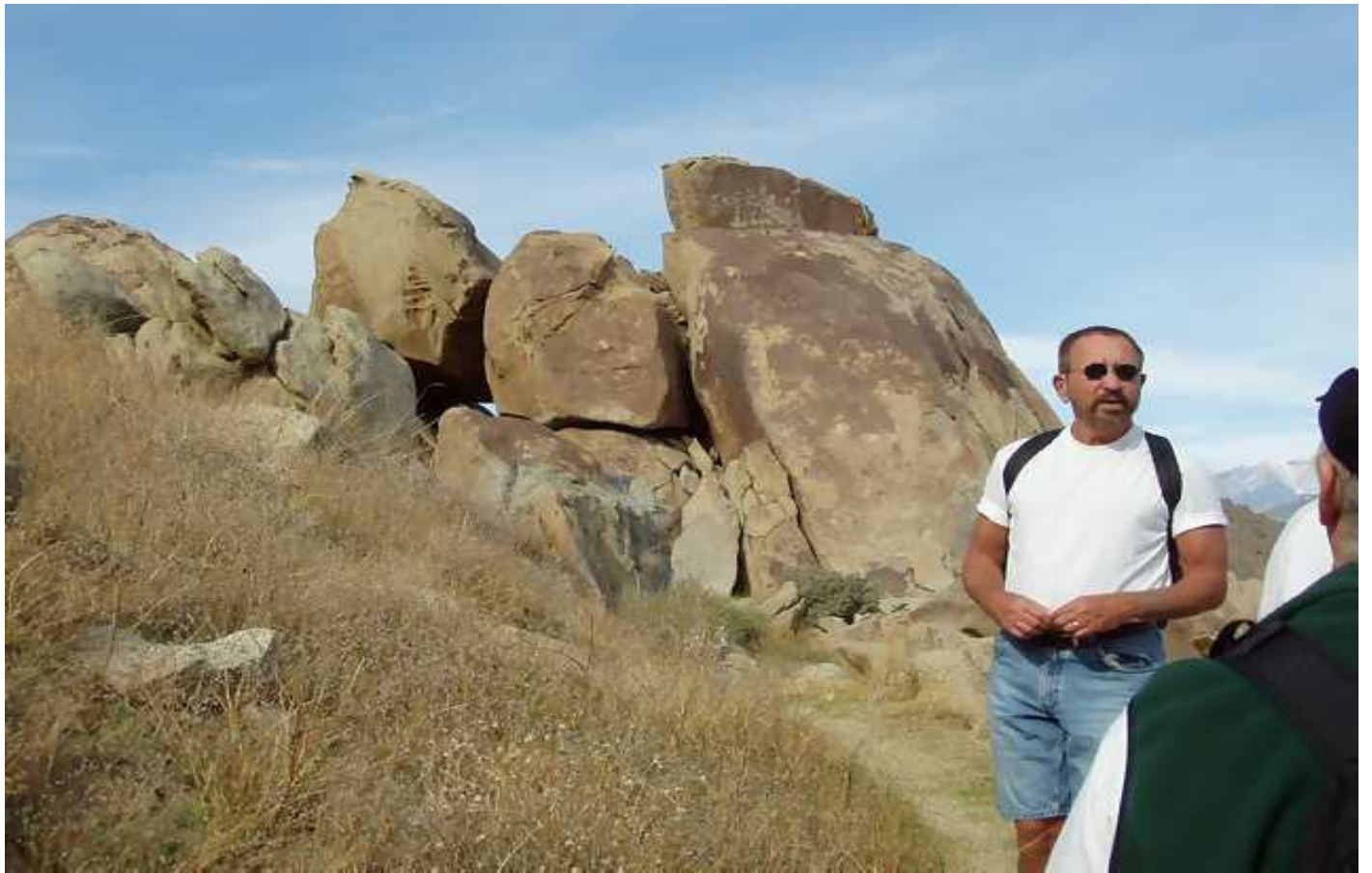
The beautiful hike into Snowcreek revealed many signs of wildlife such as snakes and a tarantula.