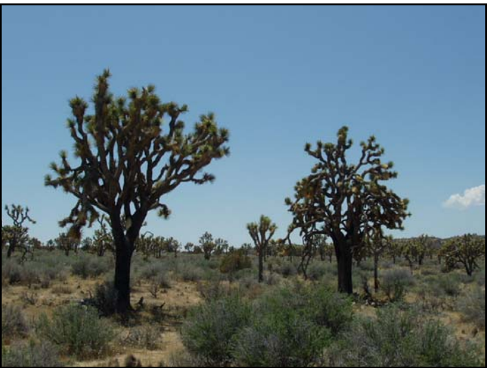
Day Hike: Joshua Tree Covington Loop Trail on 7 June