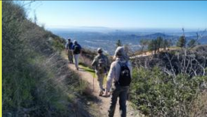
Dawn Mine Day Hike, January 29, 2017