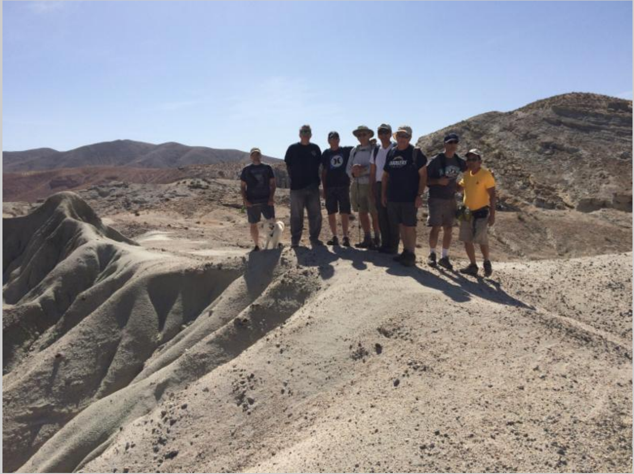
Red Rock Canyon State Park Car Camp