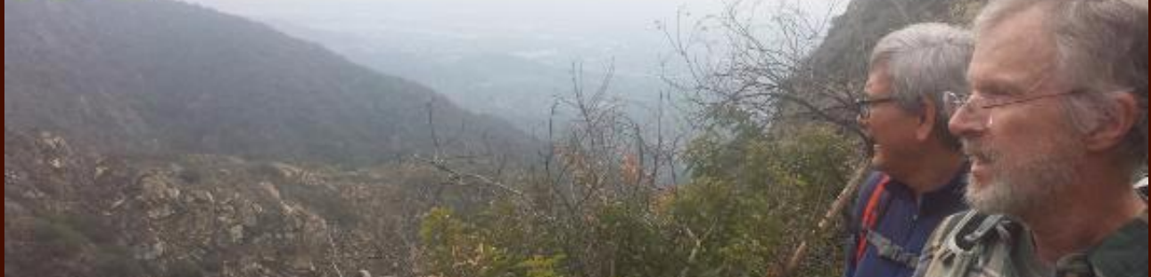
Orchard Camp Day Hike