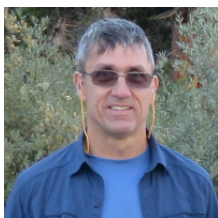
Secretary, Newsletter and Webmaster: