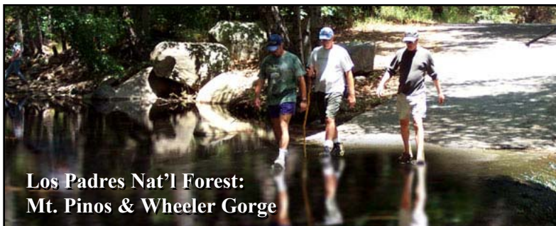
Los Padres Nat'l Forest: Mt. Pinos & Wheeler Gorge

Camp under pinetrees just a short walk from Idyllwild for shops, ice cream and restaurants. Pay showers, flush toilets. Bingo, prizes, mega potluck. RVs/Tents.